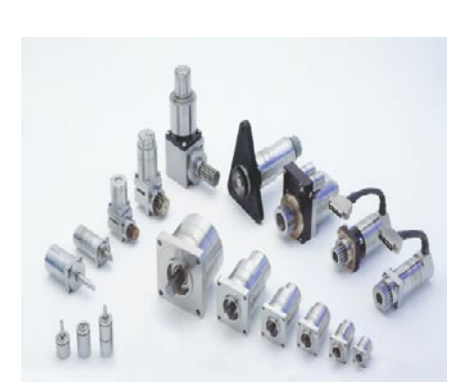
Compact and Customizable Housings

Significant advantages can be realized by utilizing state of the art generators, rather than expensive batteries or hundreds of meters of tether line, to supply power for your downhole application needs. High reliability in harsh environments, compact design, and a prolonged lifetime of power generation make CDA's generators ideal for the downhole environment.